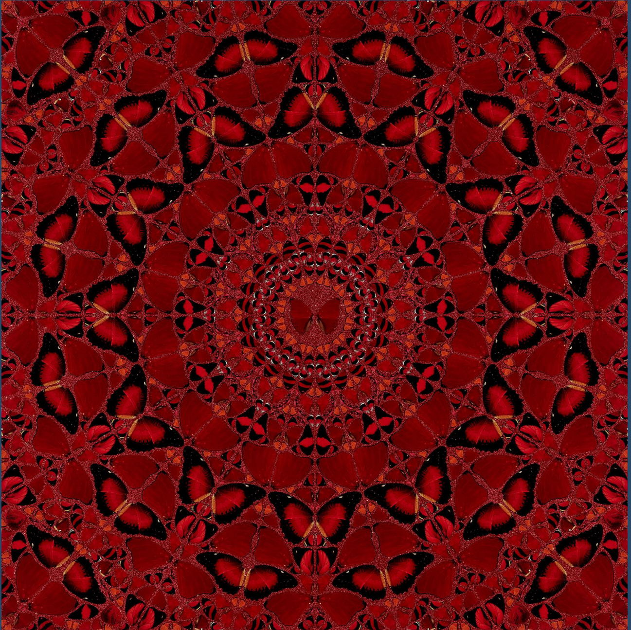
Damien Suiko, 2022, Laminated Giclée print on aluminium composite, screen printed with glitter, 100 x 100 cm, signed and dated on the label