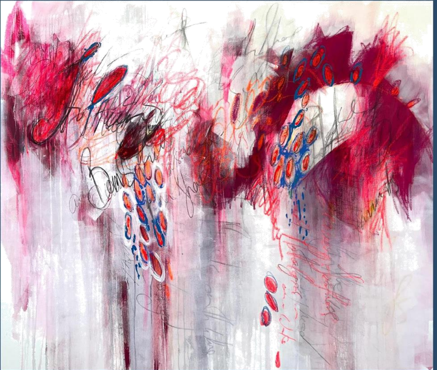
Vanessa Berlein - Swallows on my head, Acrylic, oil and oil stick on canvas, 185 x165 cm