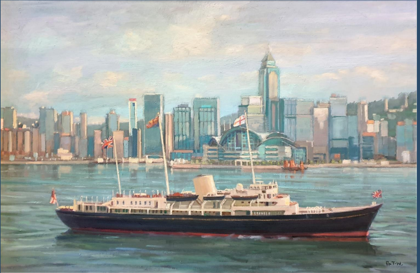
Pip Todd-Warmoth HMS Royal Britannia in Victoria Harbour, Hong Kong, oil on board, 60 x 100 cm