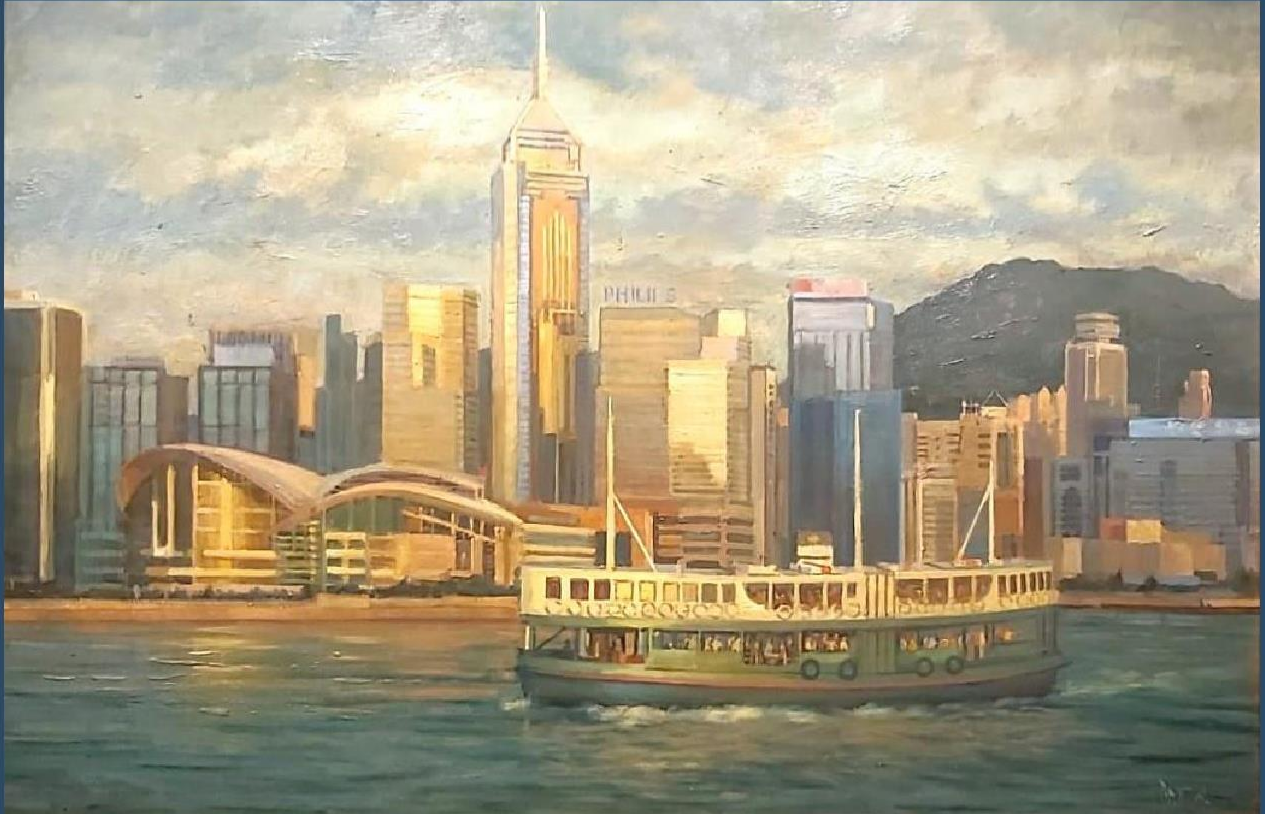
Pip Todd-Warmoth – Star Ferry at Hong Kong Harbour, oi on board, 68 x 90 cm