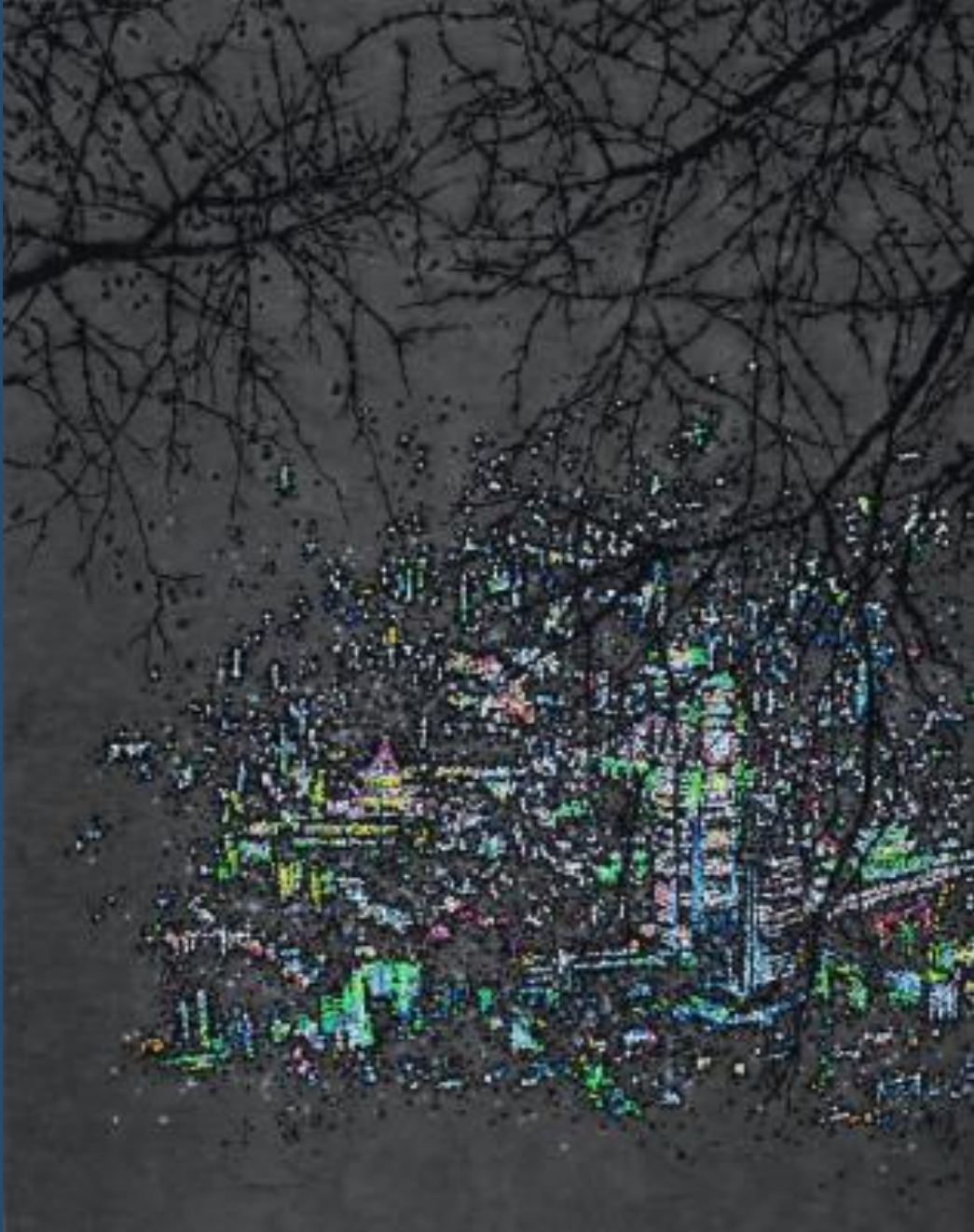
Chen Jun– Silent shadow no.2, mixed media on paper, 150 x 120 cm